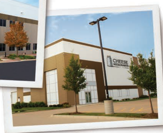
WEST CHICAGO, IL