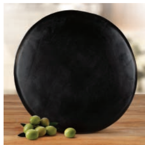
BLACK WAXED PARMESAN, ROMANO, ASIAGO WHEELS