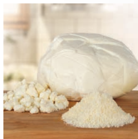
MEXICAN STYLE CHEESES