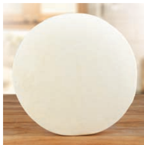
PARMESAN, ROMANO, & ASIAGO WHEELS