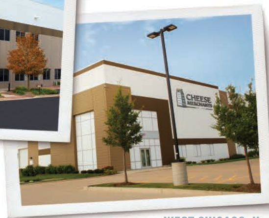
WEST CHICAGO, IL