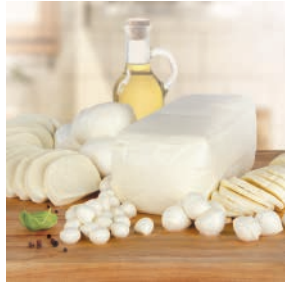
FRESH MOZZARELLA PLANT-BASED